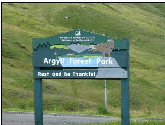
"Rest and Be Thankful, Scotland"

One of my favorite places is Scotland and, in particular, the Highlands of Scotland. The Highlands are a place of majestic beauty, but it can also be a difficult place to travel through, due to the roughness of the terrain, frequent rain and high winds. Roads can be washed out or blocked by fallen rocks. These delays aren't common today, but a century ago they were commonplace. There is one road in particular that is infamously tough to navigate, it's called the A83. At one point the A83 climbs a treacherously steep mountain named The Cobbler. Landslides and falling rocks are frequent on The Cobbler. In the era of the horse and buggy, people climbed the mountain knowing it would be time consuming, arduous and potentially dangerous. A tradition began that when travelers finally made it to the top, they'd stop to rest and give thanks to God for their safe passage. If you travel to the top of the mountain today there is a stone to mark the spot where people stopped to rest and there is a car park near the stone marker where you can take in the view, it's magnificent. The name of this place is "Rest and be Thankful." I love how the