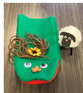
(Puppet and sheep that one of the Residents made)

of our time just loving the residents and sharing the Lord's love. We were able to bless them with all the games and craft items that you donated, they really appreciated those since the residents' love doing crafts and playing games in their homes. They live in houses that have six residents per household sharing the communal living space. We thank the church for the support of the puppet team and the mission trip opportunity.