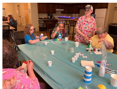
Residents making lighthouse craft